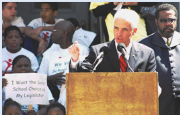
Governor-Elect Charlie Crist advocates for school choice at 2004 Step Up For Students Rally.

We thank all of our families who took the time to vote this election and we look forward to working with all the new and returning legislators this coming year. Your continued involvement will be necessary as we fight to protect school choice in Florida.