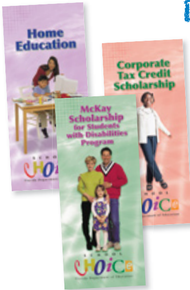
School choice brochures are available for download.

The Office of Independent Education and Parental Choice, as part of the Florida Department of Education, works diligently to educate parents about their school choice options through the School Choice website at www.floridaschoolchoice.org . The link titled "Parent Resources" located on the Quick Navigation bar on the far left-hand side of the screen lists valuable links to resources to aid parents in exercising school choice for their children.